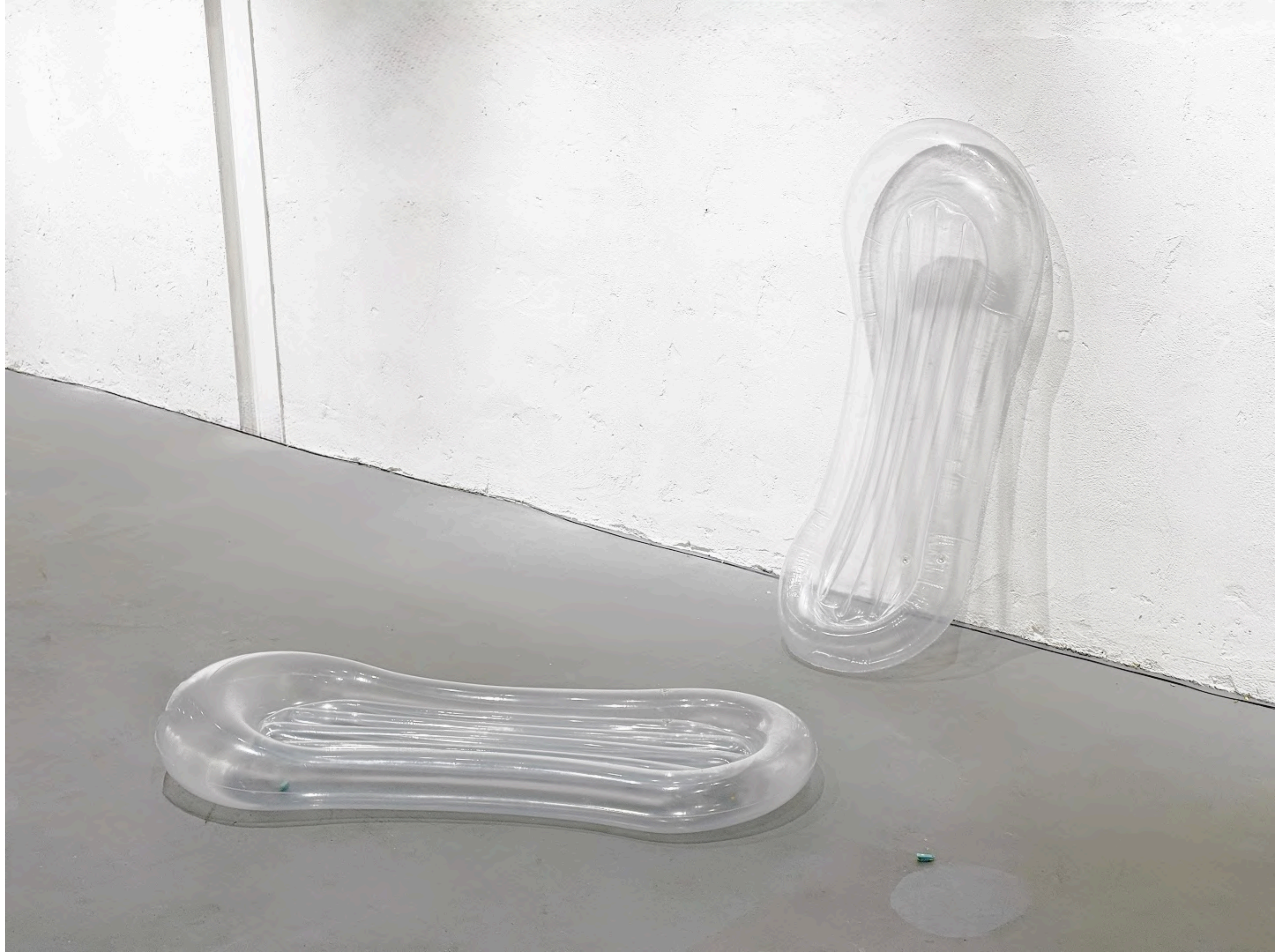
Insomnia, 2021 install shot