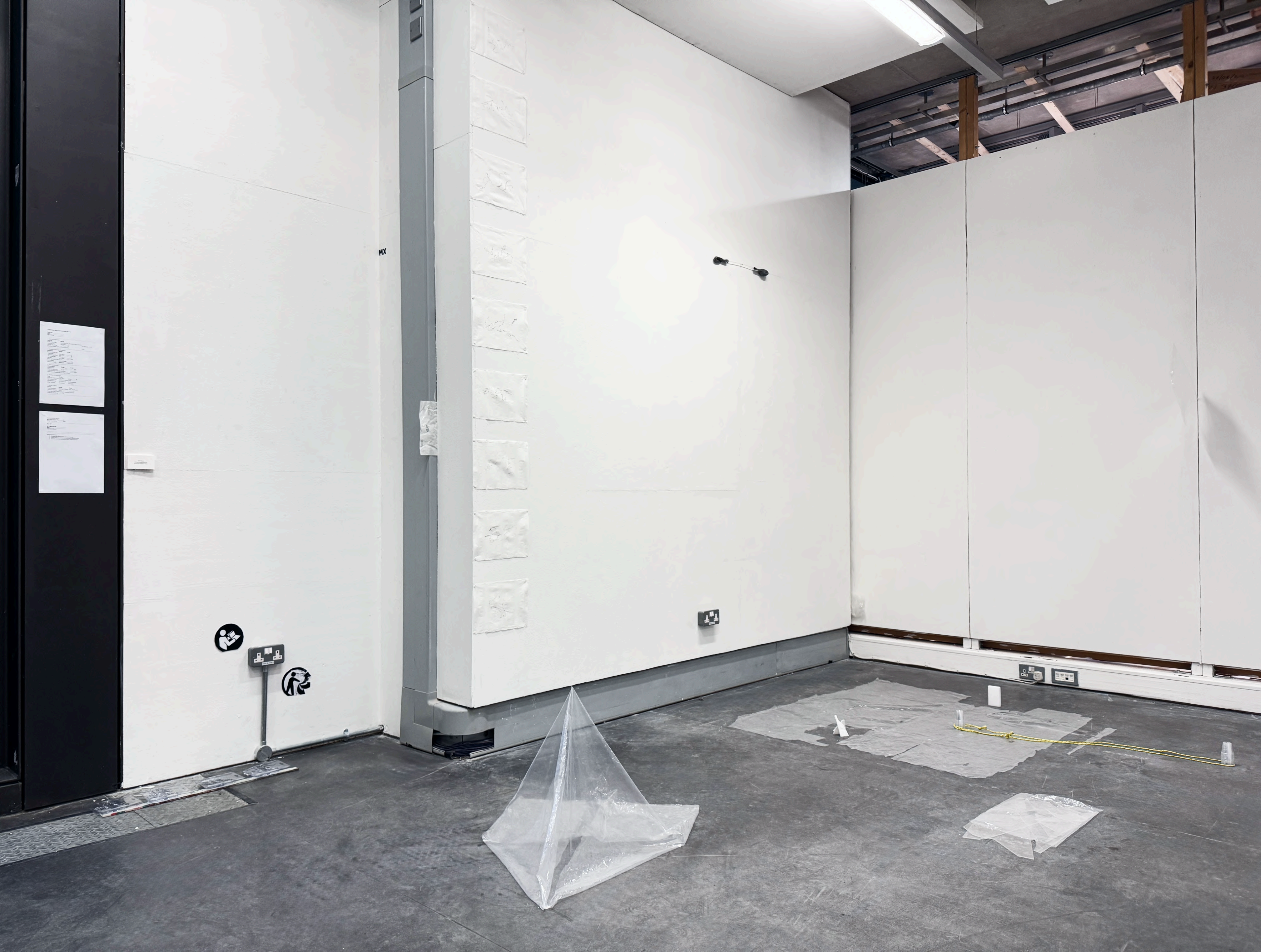
Pre-am (2), 2025 install shot