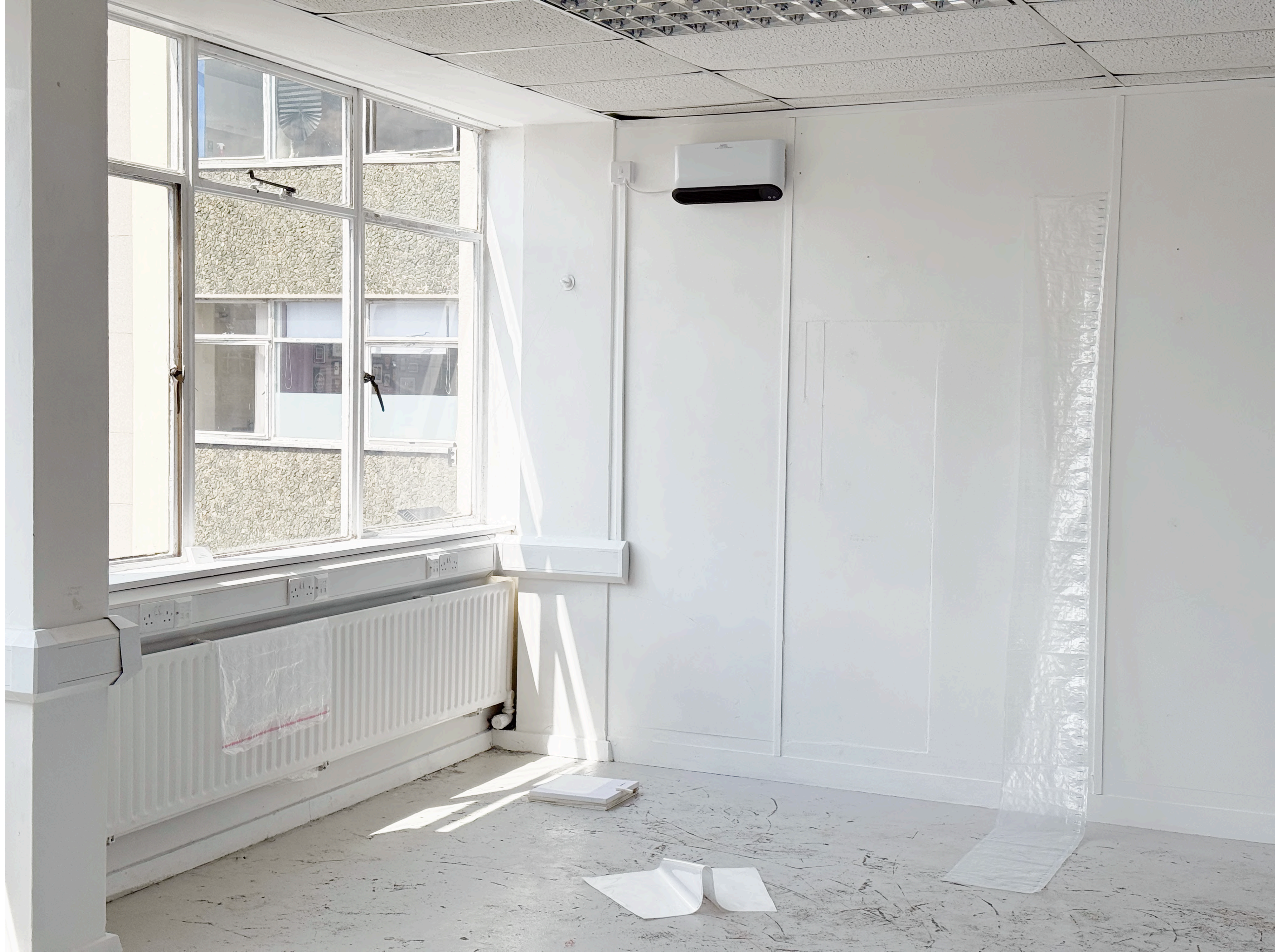
Pre-am (3), 2025 install shot