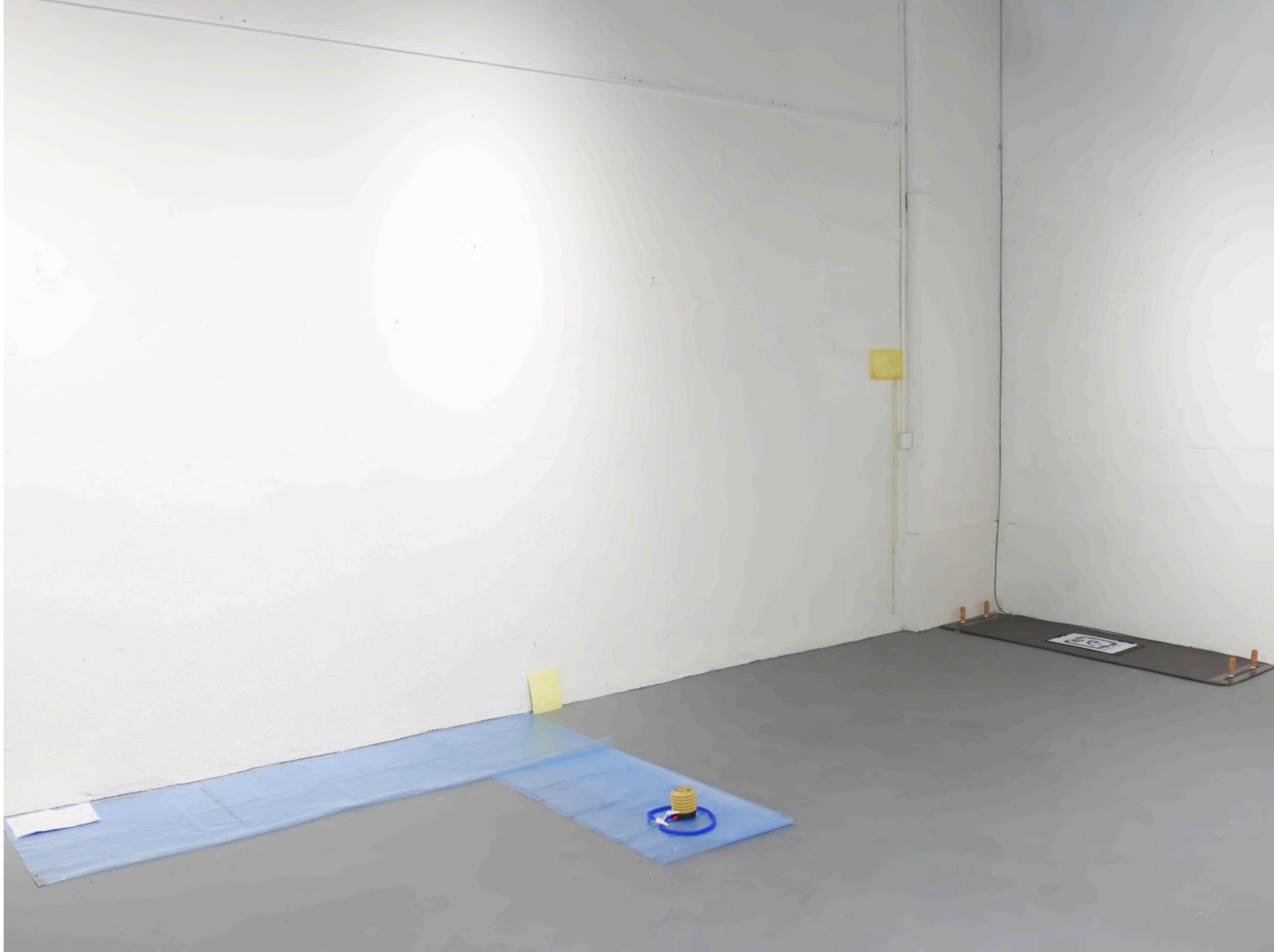
am, 2025 install shot