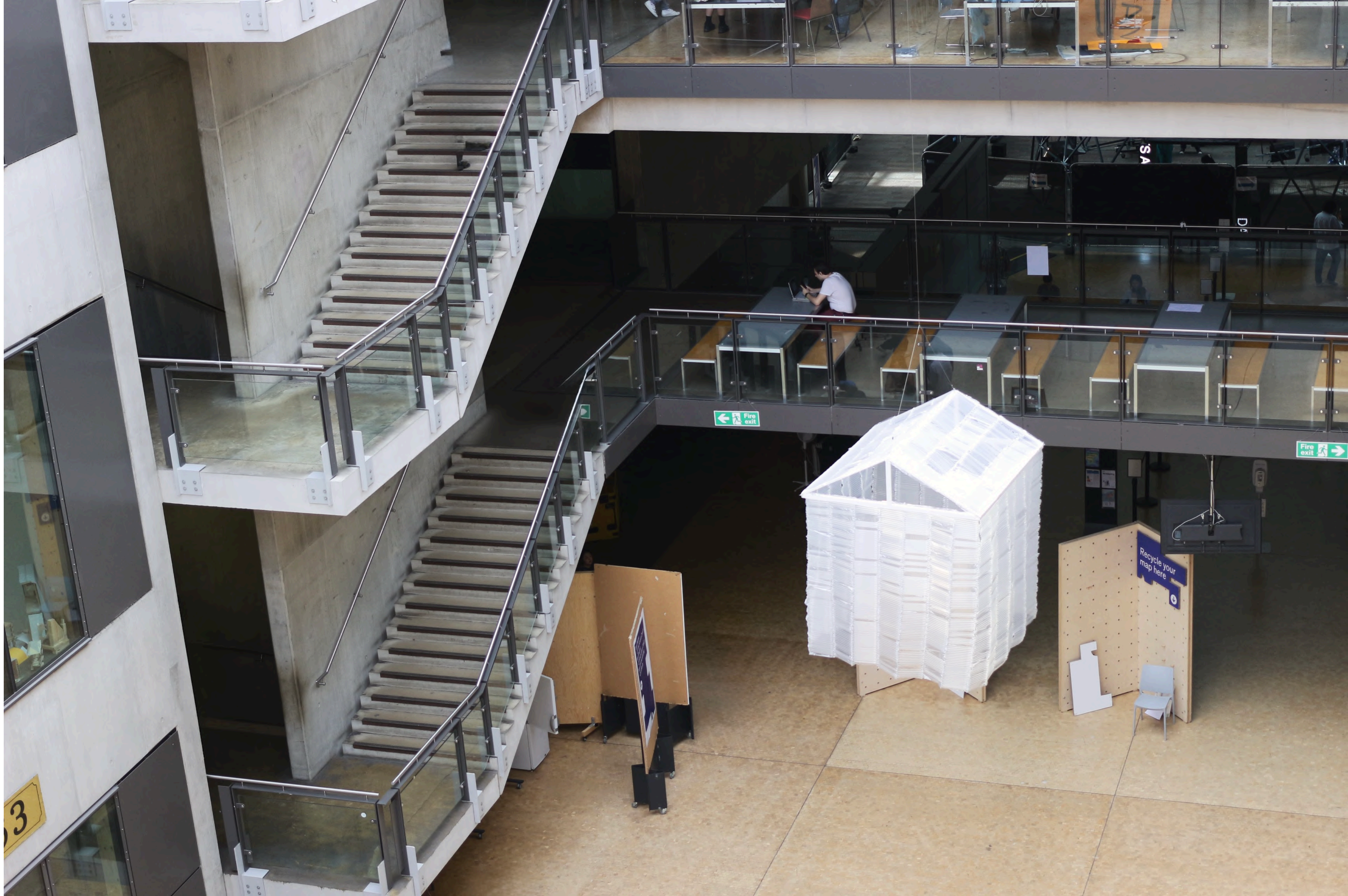
am, house, 2025 public install shot