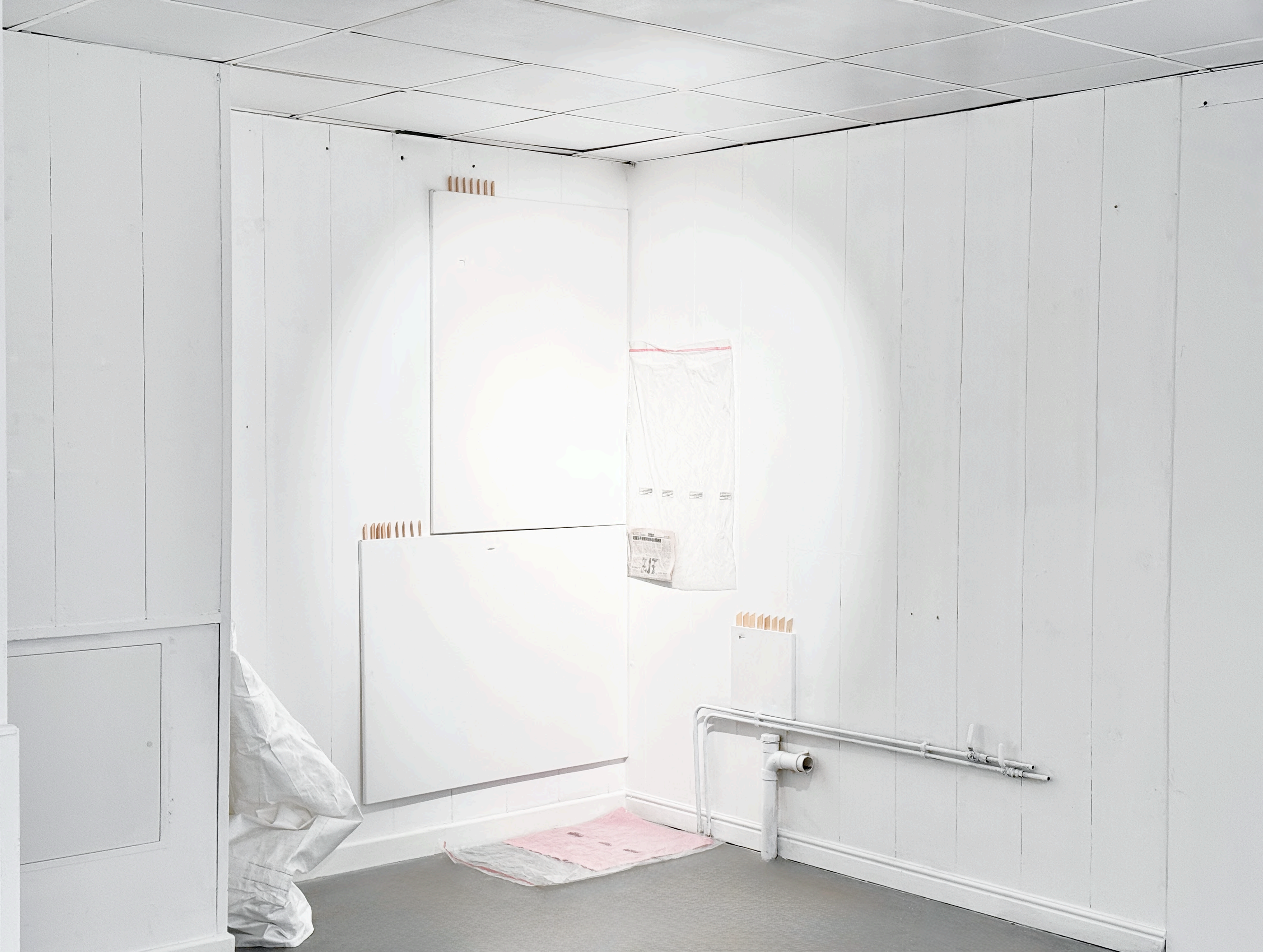
Backroom, bündel, 2025 install shot