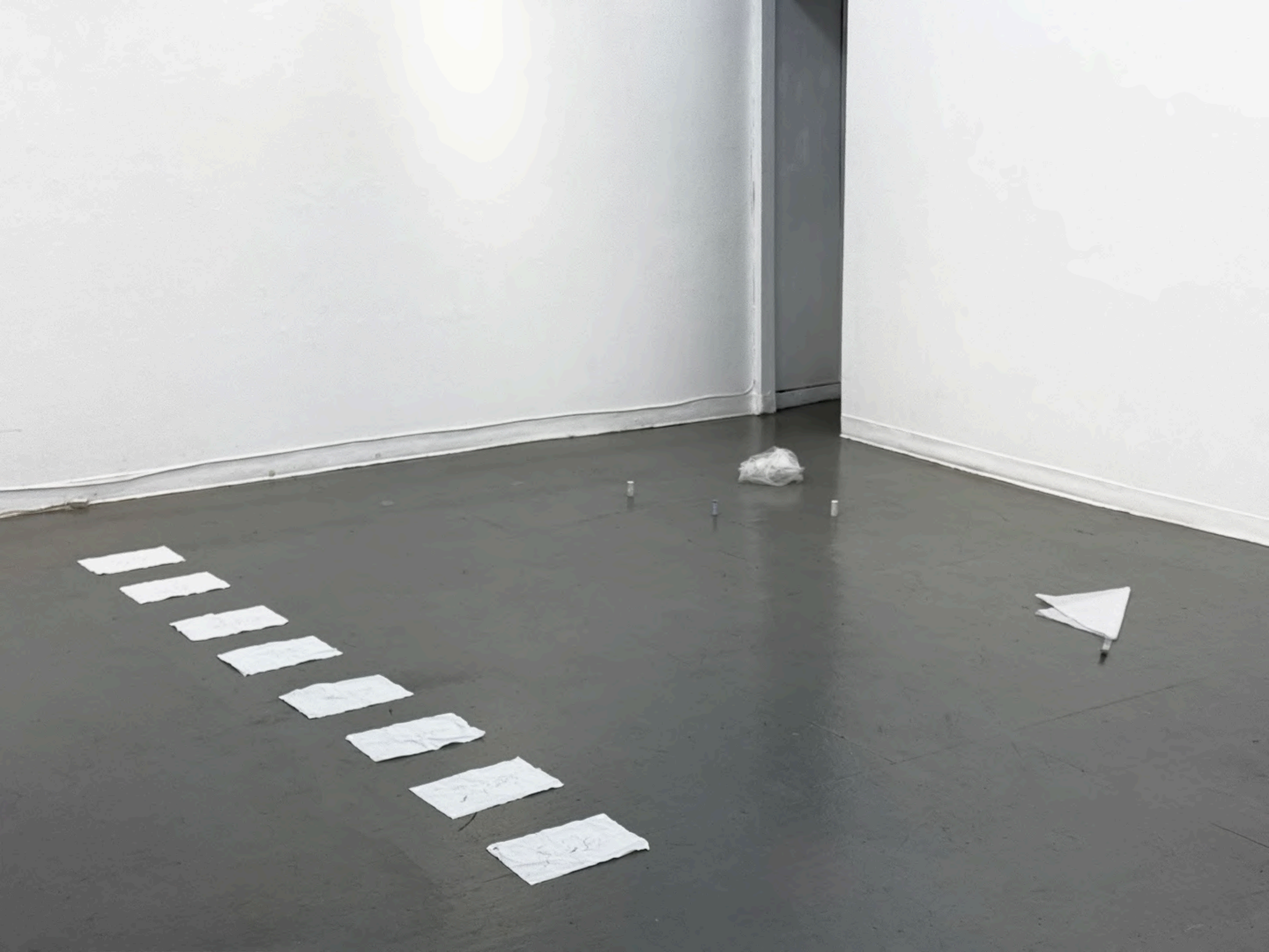
if, 2025 install shot