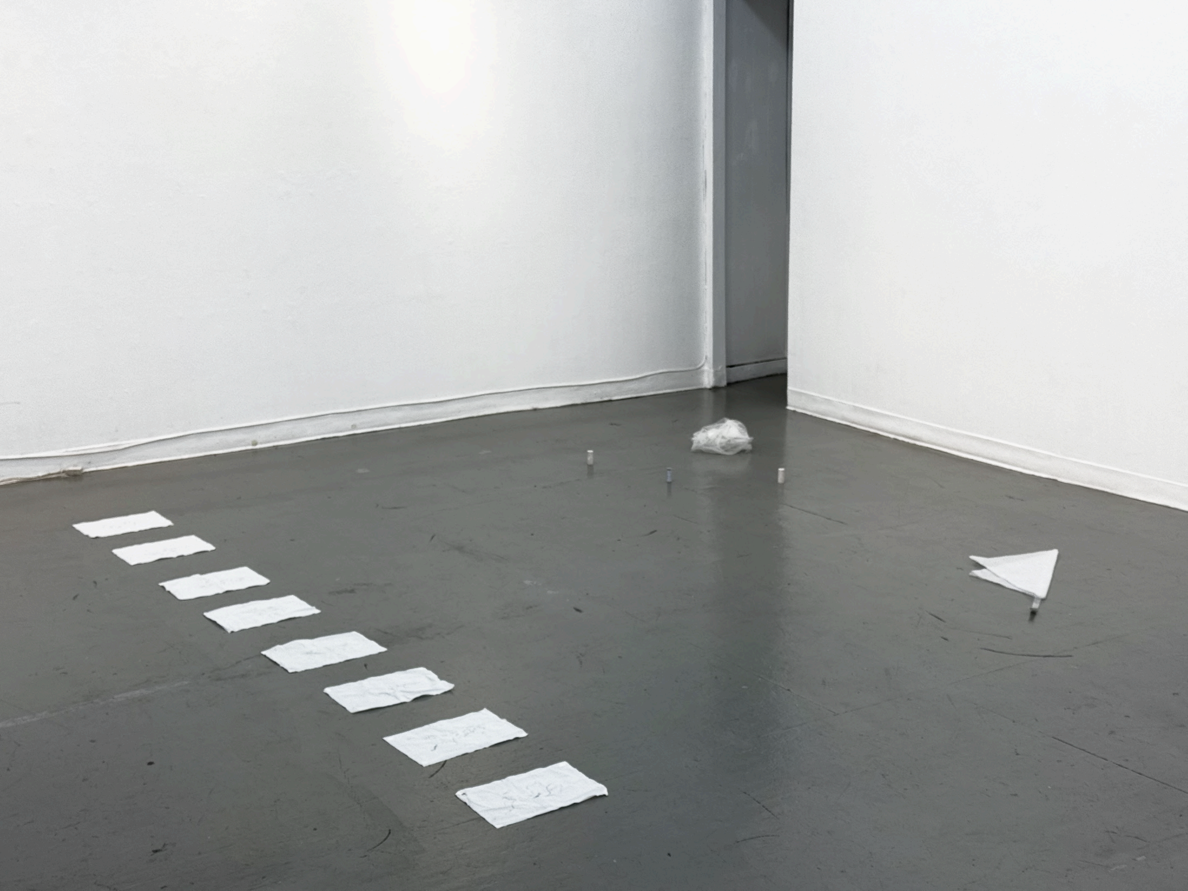
if, 2025 install shot