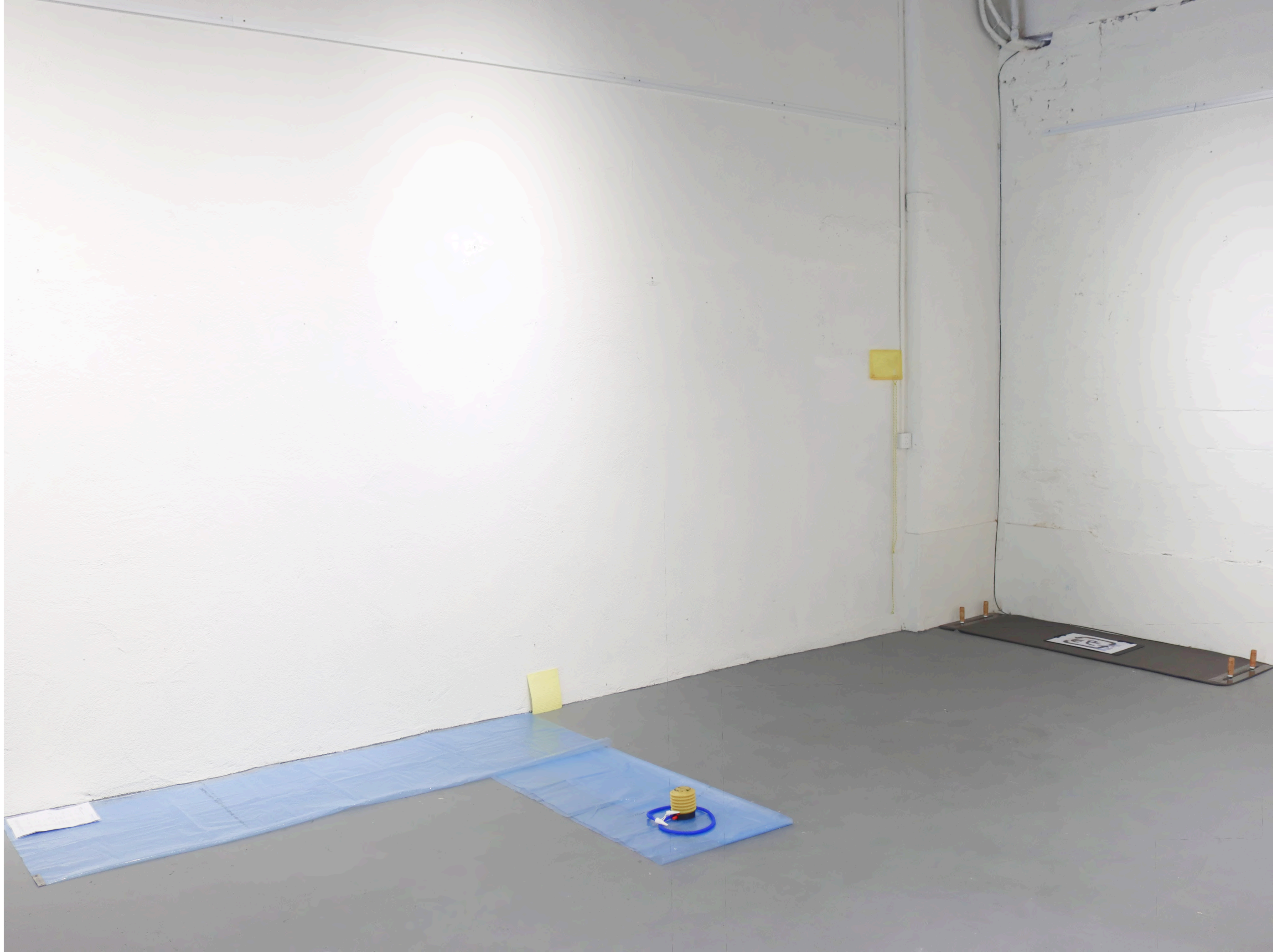
am, 2025 install shot