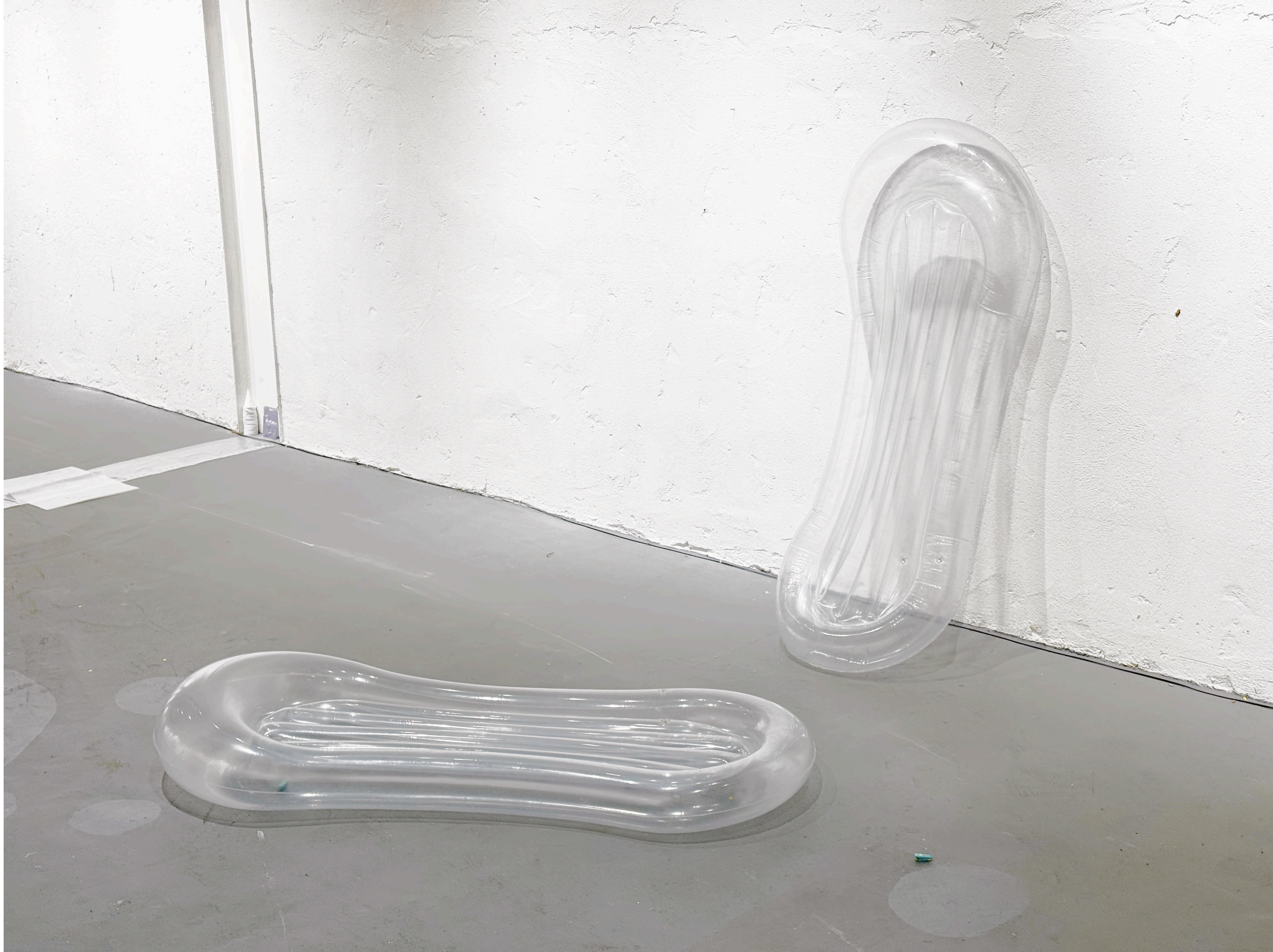
Insomnia, 2021 install shot